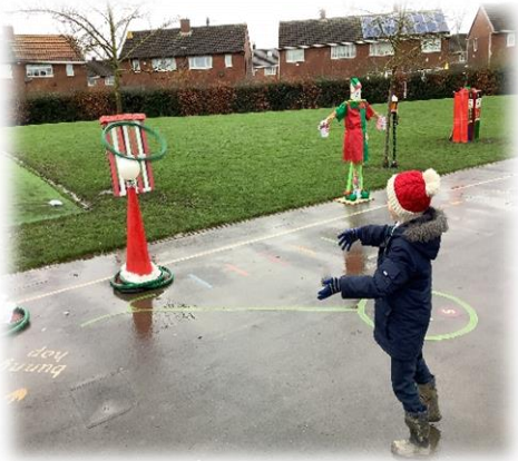
Good old-fashioned carnival fun.